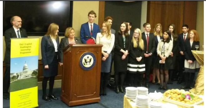
Rep. Ileana Ros-Lehtinen of Florida.