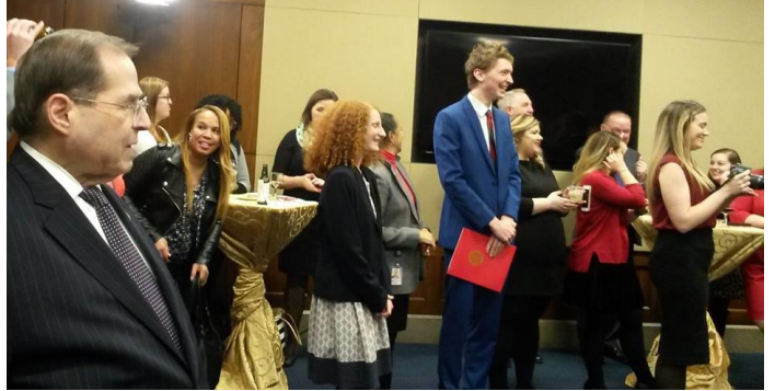
Rep. Jerrold Nadler of New York, a long-time congressional host, looks on as the program begins to celebrate the 2017 group and their hosts.