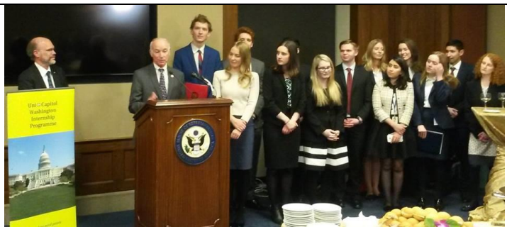
Rep. Joe Courtney of Connecticut.