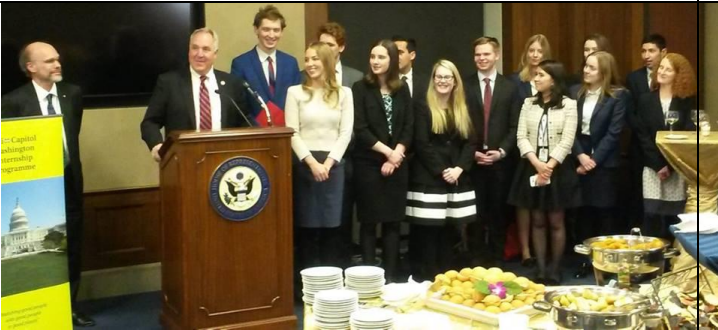
Rep. John Shimkus of Illinois.