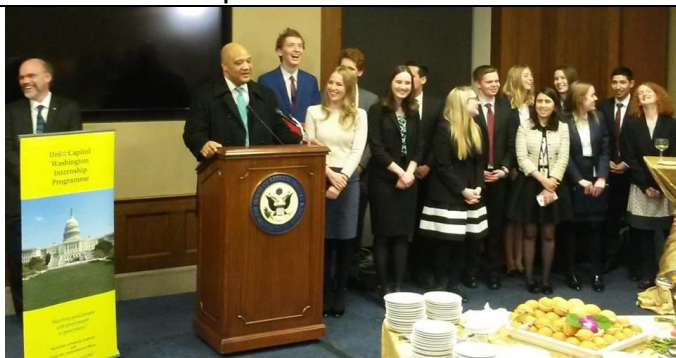
Rep. Andrew Carson of Indiana, a first-time congressional host.