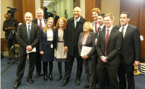
Five Members of Congress attended this bi-partisan, bi-national gathering.

Starting in 2004, UCWIP has organized an annual reception on Capitol Hill supported by all UCWIP partner Australian universities. These are a few scenes from the February 14, 2017 – Valentine's Day - event, held in the Rayburn House Office Building courtesy of the office of Assistant Democratic Leader Rep. James Clyburn of South Carolina.