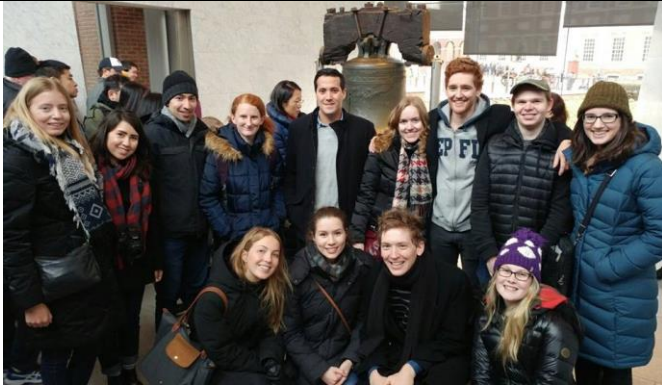
A visit to The Liberty Bell in Philadelphia, invaluable assisted by the National Park Service.